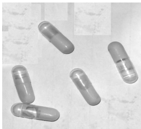
Figure 1: Semisolid matrix of Ketorolac filled in hard gelatin capsule shell.

In vitro dissolution study of semisolid filled capsules of KT was performed in a USP Type III Dissolution Apparatus (Electrolab, India). The study was carried out for 8 hours where paddle speed was set at 50rpm and dissolution media was 900ml distilled water maintaining the temperature at 37 \pm 0.5^\circ\text{C} . Dissolution samples were withdrawn at predetermined intervals and each time the sink condition was maintained with fresh distilled water. Withdrawn samples were analyzed for drug content by a spectrophotometer (UV mini-1240, Shimadzu Corporation, Japan) at 322nm.