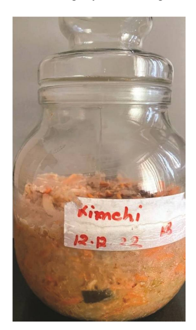
Figure 1. Homemade fermented kimchi.

Preparation of kimchi: Traditionally kimchi was prepared at home using fresh cabbage, rice flour, garlic, fresh ginger root, red pepper powder, radish, green onions, carrot and non-iodized salt (NaCl) (Figure 1). Briefly, cabbage was cut into small pieces and then rinse with water. 3% salt solution was used to dip cabbage pieces for 4 hours. The cabbage pieces were then rinsed three time with water. Then the rice flour paste and other ingredients were mixed with cabbage thoroughly. Finally, the kimchi was packed tightly into the container to prevent air exposure and promote brine formation. The container was kept in relatively constant room temperature (about 30°C) for 37 days, tasting it daily until it reaches preferred tangy taste and desired texture. Stored fermented kimchi was covered tightly in the refrigerator.